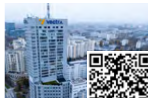
Babka Tower campus

80 Jana Pawła II St. 2nd and 3rd floor 01-043 Warsaw Poland