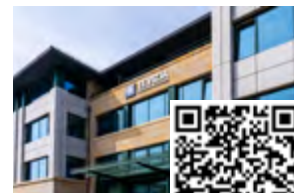
Wiśniowy Business Park campus